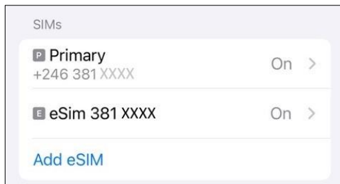
How an eSIM will look on your iPhone Shown alongside a regular SIM

During this initial post launch period physical SIMs will remain our primary way of connecting you to our Sure4G network. As for physical SIMs, you must come into our shop to sign-up for service to use an eSIM.